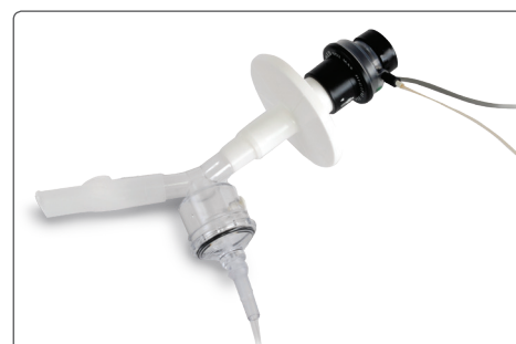
Integrated dosimeter for automatic broncho-challenge tests