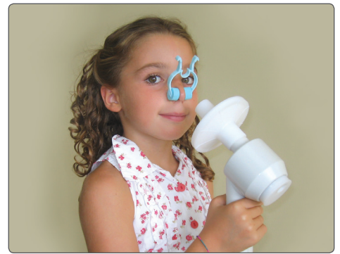
The interrupter technique (Rocc) is highly indicated for airway resistance assessment in pediatric applications