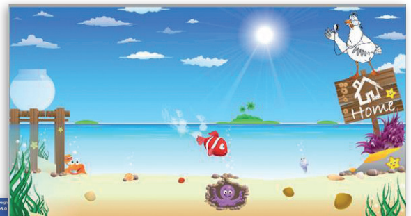
Innovative pediatric incentivation with selectable effort grade.